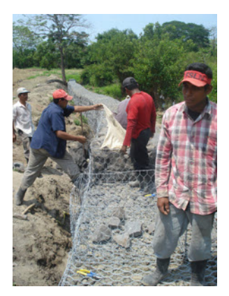
Family members helping to build the flood barriers