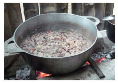
Rice and beans with a twist